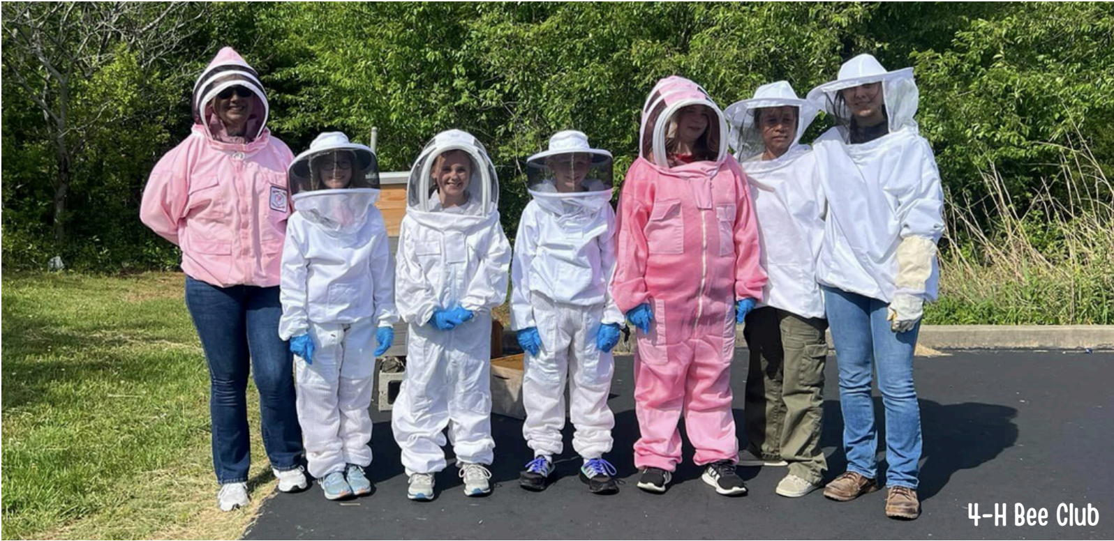
4-H Bee Club