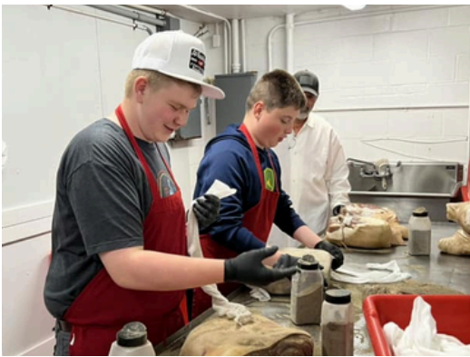
Country Ham Project