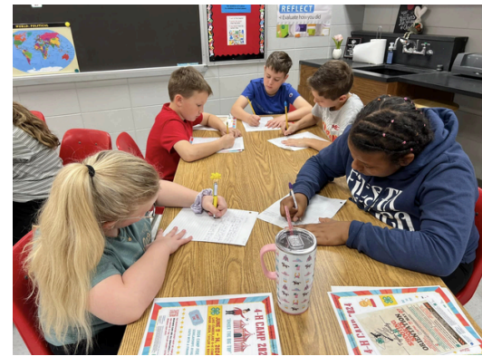
TCIS 4th Grade