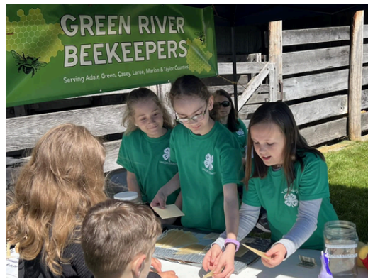
Bee Club at Plow Days