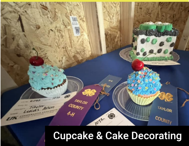
Cupcake & Cake Decorating