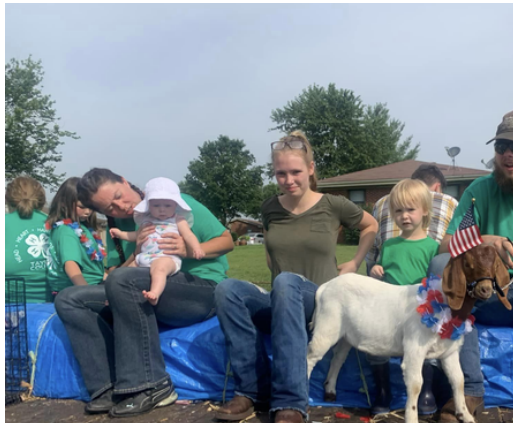
4-H Parade Float