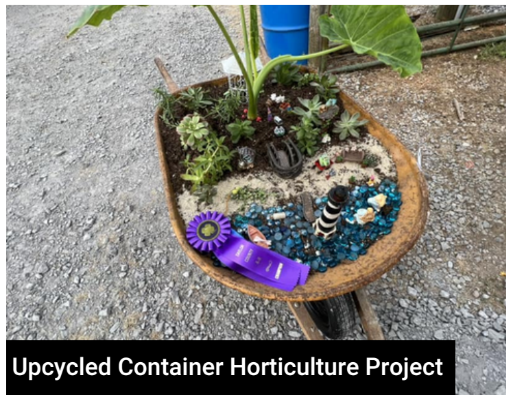
Upcycled Container Horticulture Project