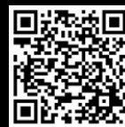
Egg Chef Challenge