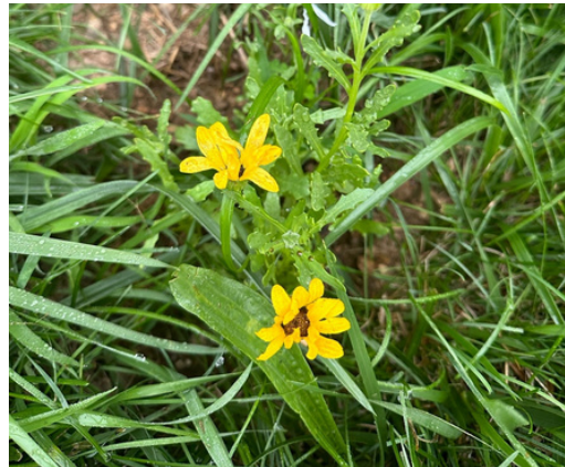
4-H Sunflower Contest