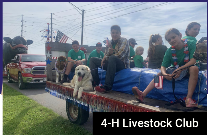
4-H Livestock Club