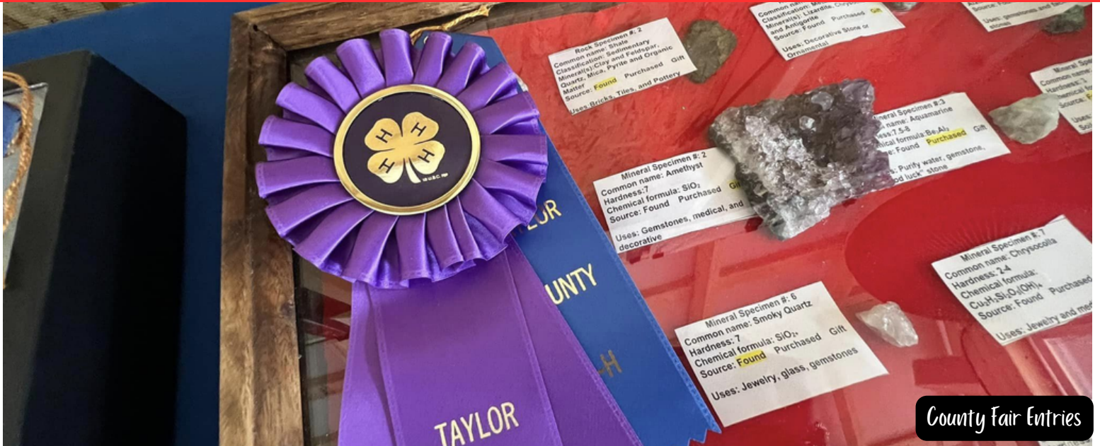
County Fair Entries