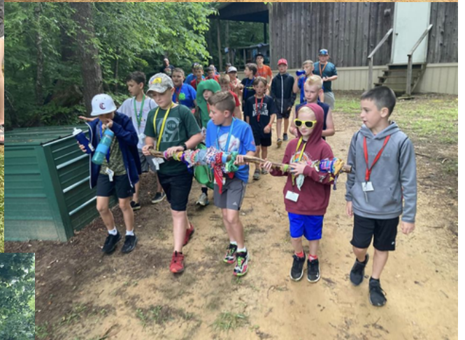
2023 Campers and Volunteers