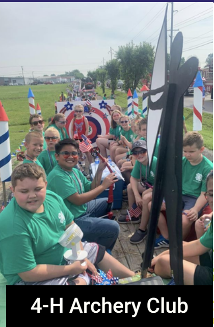
4-H Archery Club