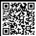
Chicken or Turkey

FOR EGG CHEF CHALLENGE CONTEST - HTTPS://UKY.AZ1.QUALTRICS.COM/JFE/FORM/SV_4VDS42MMDTKRFOG