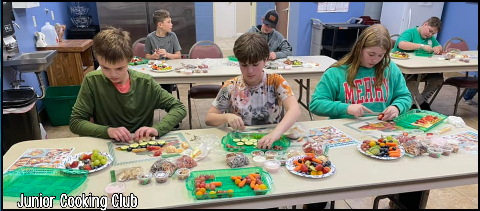
Junior Cooking Club