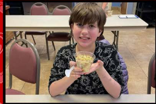
Junior Cooking Club