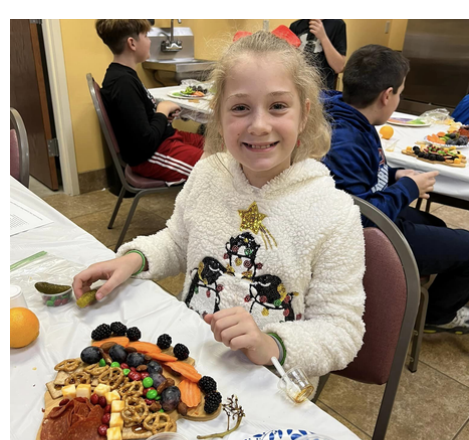
Holiday Charcuterie Boards