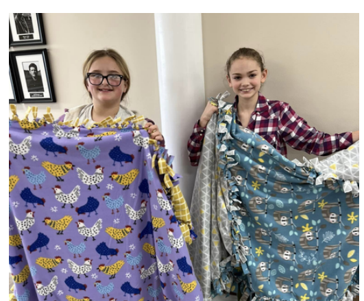
No Sew Blanket Class