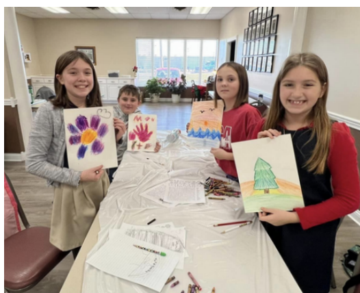
Terrific Thursday with KCA