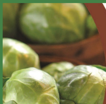
Plate it up!

Nutritional Analysis: 220 calories, 9 g fat, 3.5 g saturated fat, 0 g trans fat, 70 mg cholesterol, 340 mg sodium, 11 g carbohydrate, 3 g fiber, 4 g sugars, 23 g protein.